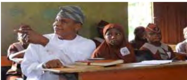
... Says New Teachers Will be Recruited to Improve Learning

L agos State Government has urged teachers, non-teaching staff, students and pupils in the State to make the year 2024 count for excellent performance in their various teaching and learning deliveries as schools resume for the second term of the year 2023/2024 session.